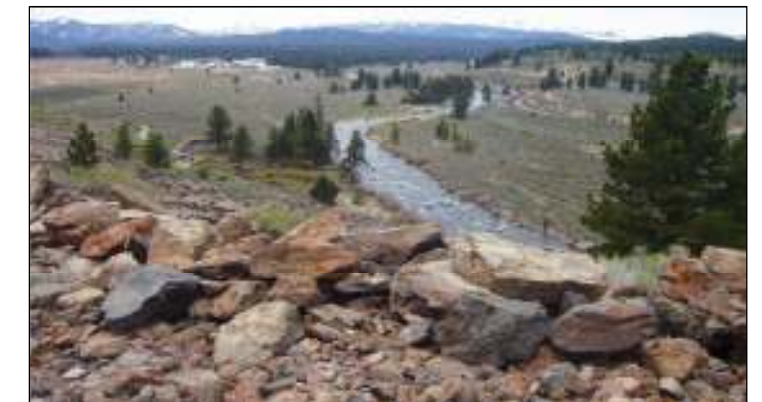
Site for Truckee River Legacy Trail – Phase 3B

Truckee River Legacy Trail – Phase 3B is a 8 to 10 foot wide Class I paved trail being constructed along the south side of the Truckee River ( photo to right ), connecting Phase 3A of the trail to Glenshire Drive. The project includes a new bridge across Martis Creek. Construction will start August 2013 and go until October 2014. The project cost is $4.2 million and is funded by RSTP funds, a River Parkways Grant, and Truckee Special Service Area #5 (Glenshire) funds.