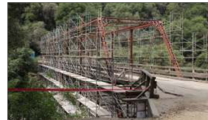
Purdon Crossing Bridge during rehabilitation

Magnolia Crosswalk project will install a pedestrian crosswalk to connect Lake of the Pines (LOP) community to the Combie/Magnolia Class I pedestrian path near Magnolia School. The project proposes to reduce vehicle trips and traffic congestion by providing a safe route for pedestrians/students living in LOP. A pedestrian actuated flashing light system and associated crosswalk with signage and striping is an essential element in making the facility safe and functional on a major collector roadway, especially for school children and parents. The project connects LOP to Bear River High School, Cottage Hill Elementary School, and Magnolia Intermediate School. Ultimately it will also connect LOP to a larger pedestrian facility that will run along Magnolia and Combie Roads from Kingston Lane to SR 49 (approximately 2 miles). The total budget is $45,000 and funding is from AB 2766 grant funds and State Exchange Funds.